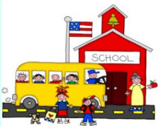
Know 'My School'