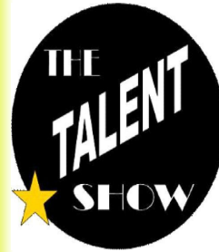
Talent Show Emerald