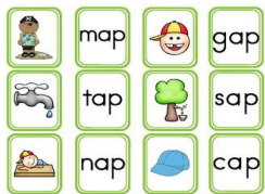
Let's meet 'ap' words