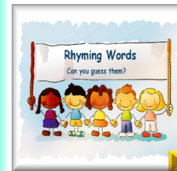
Match the rhyming words