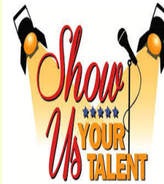
Talent Show Sapphire