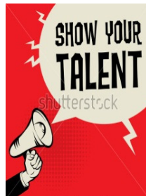
Talent Show Ruby