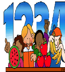
Count and Write