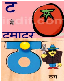
आओ लिखें ट, ठ